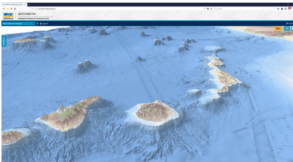
3D visualisation of the Canary Islands